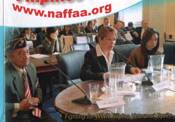
Fighting for WWII Filipino Veterans' Equity