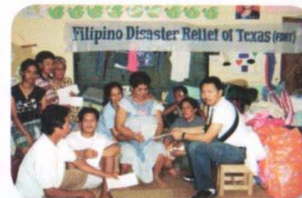
Giving relief aid to victims of natural disasters in the Philippines and USA