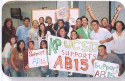
Helping our youth develop leadership and entrepreneurial skills by involving them in national and regional events