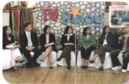
Being seen and heard across America with TV, radio and newspaper campaigns