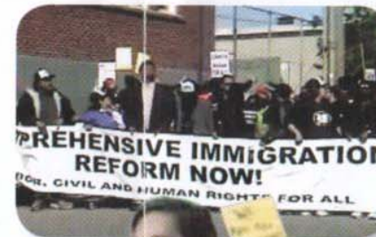
Marching for Comprehensive Immigration Reforms