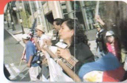
Fighting against Discrimination