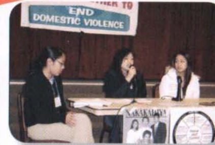
Coming together to prevent and end Domestic Violence through education and community building