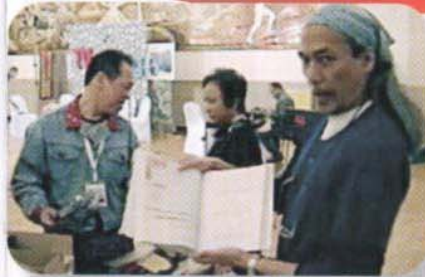
Donating excellent study materials and giving bilingual classes to help Filipino high school students pass standardized examinations